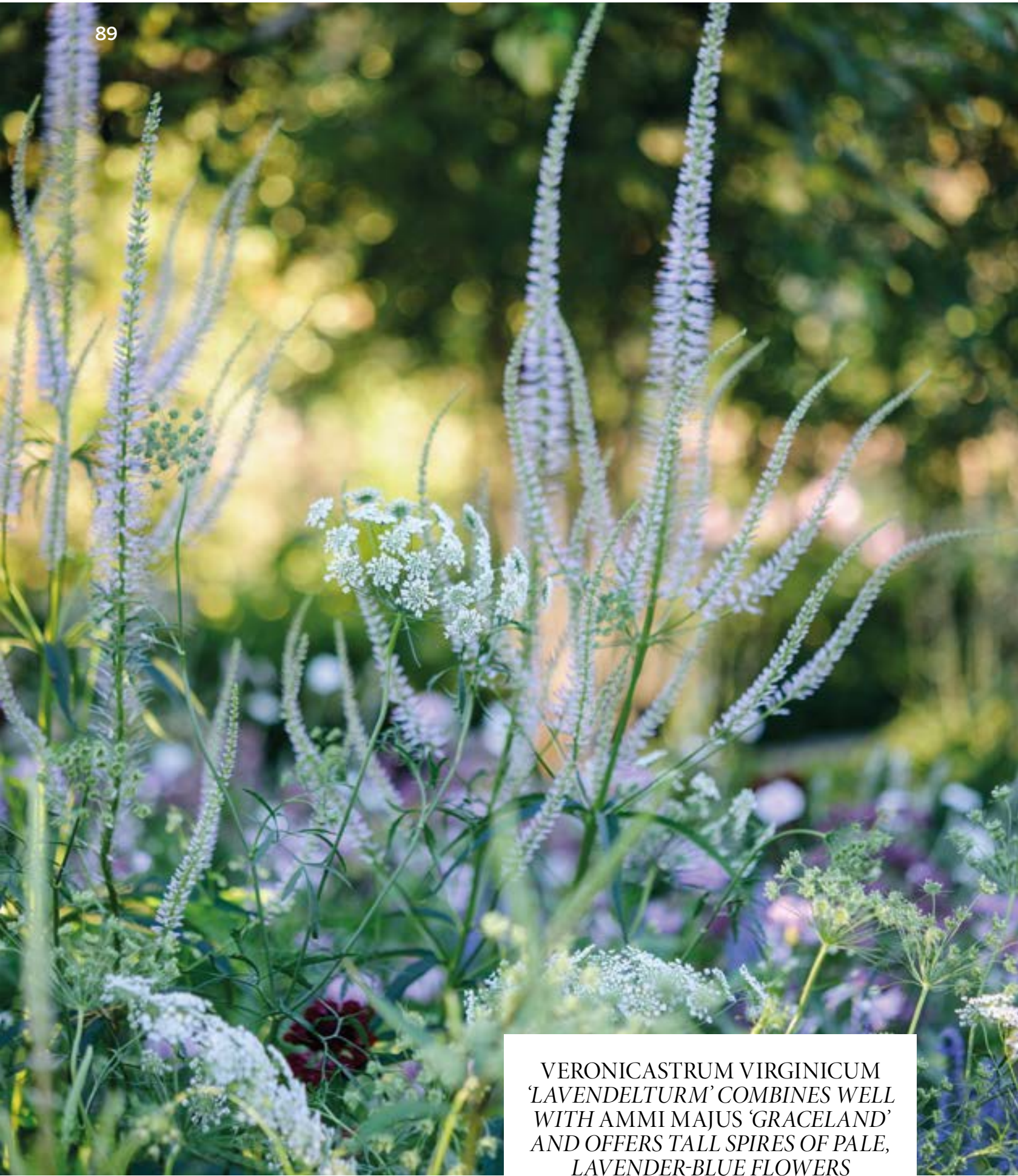
VERONICASTRUM VIRGINICUM 'LAVENDELTURM' COMBINES WELL WITH AMMI MAJUS 'GRACELAND' AND OFFERS TALL SPIRES OF PALE, LAVENDER-BLUE FLOWERS

▷ 89 VERONICASTRUM VIRGINICUM 'LAVENDELTURM' Another V. virginicum cultivar that combines well with Ammi majus 'Graceland' and offers tall spires of pale, lavender-blue flowers. AGM. H 1.5m. S 50cm. C Any good soil; full sun or part shade. SI July – August. HR RHS H7, USDA 3a-8b.