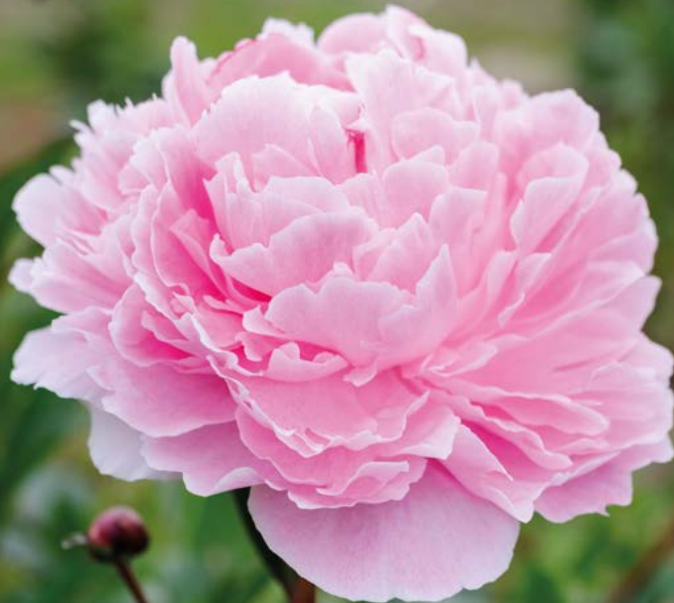
PAEONIA LACTIFLORA 'SARAH BERNHARDT' IS A CLASSIC, STRONGLY SCENTED, DOUBLE, PURE ROSE-PINK PEONY

Robust, sedum with broad leaves and an upright habit. Large, flat, green buds open to rose-pink flowers in late summer and early autumn, and last for several months. Dried flowerheads add a hint of colour and structure in winter. H 50cm. S 50cm. C Any well-drained soil; full sun. SI July – September. HR RHS H7, USDA 3a-9b.