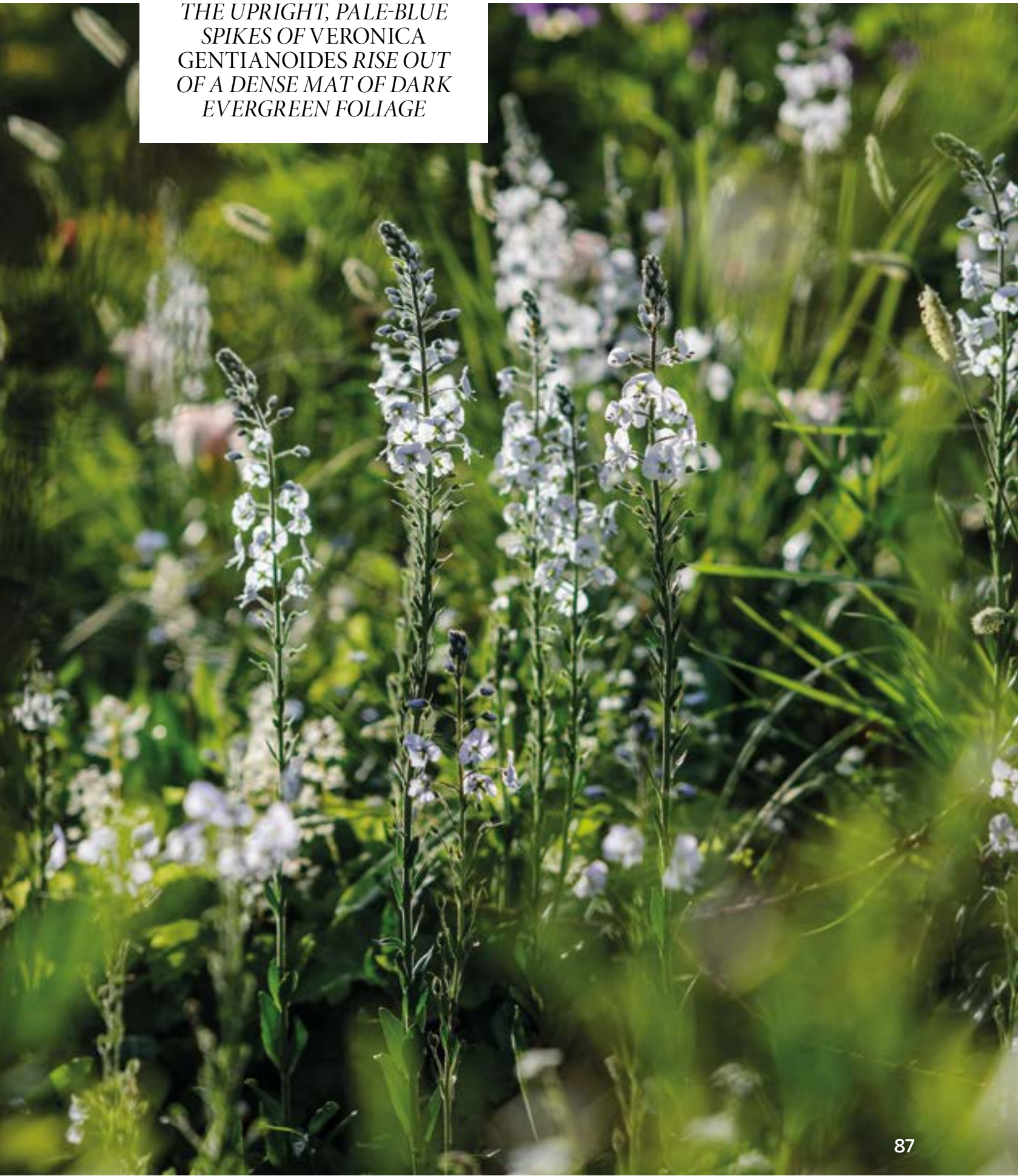
THE UPRIGHT, PALE-BLUE SPIKES OF VERONICA GENTIANOIDES RISE OUT OF A DENSE MAT OF DARK EVERGREEN FOLIAGE

75 MAXINE ADCOCK / GAP PHOTOS; 79, 81 & 87 JASON INGRAM; 83 JAN SMITH / GAP PHOTOS